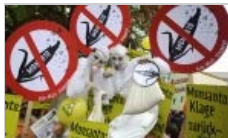
Leading Environmental Activist's Blunt Confession: I Was Completely Wrong To Oppose GMOs