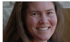
Are You Smarter Than Slate's Science Editor? Take Our News Quiz and Find Out.