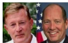
Will the New Republicans Make the House More Acrimonious—or Save It?