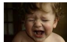
If Your Doctor Says Your Kid Has an Ear Infection, Don't Believe Him