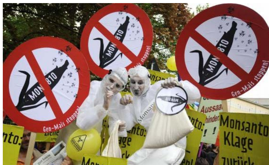
Anti-Monsanto activists in Germany in 2009