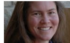
Are You Smarter Than Slate's Science Editor? Take Our News Quiz and Find Out.