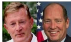
Will the New Republicans Make the House More Acrimonious—or Save It?