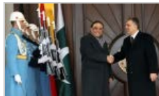
Teens Hate Twitter, World Leaders Love It