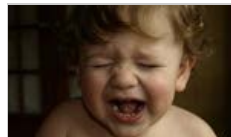
If Your Doctor Says Your Kid Has an Ear Infection, Don't Believe Him