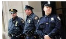
Some Tips for Avoiding "Consensual" Police Encounters