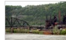
The Troubling Vigilante Activism in a Small-Town Ohio Rape Case