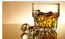
Why Do We Pay Such Big Taxes on Rum?